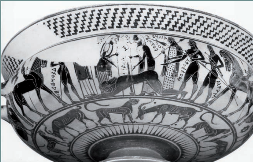
Greek vase illustrating the death of the Greek hero Aias (Ajax).

A project to record and analyse all known images of mythology from the Greek, Roman and Etruscan civilisations has reached its climax, with the launch of the last two volumes of the 20-volume series.