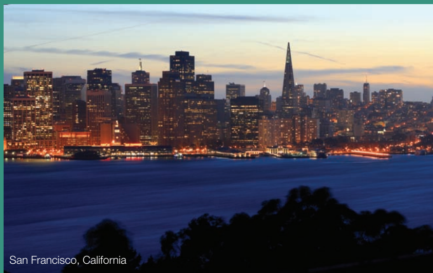
San Francisco, California