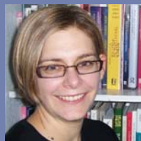
women at the top