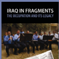
iraq in fragments